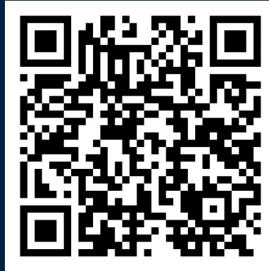
Big Hero 6