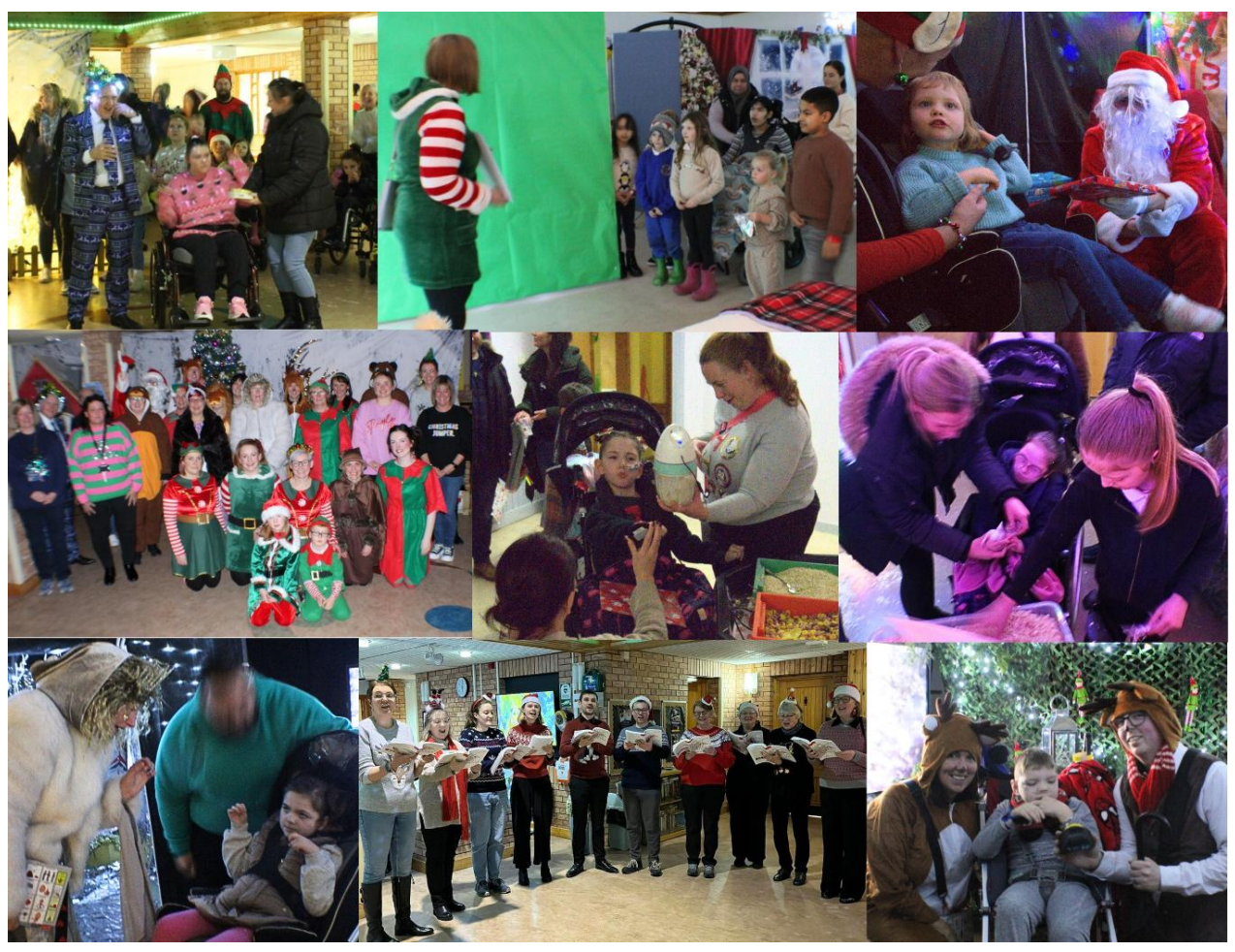
A wonderful night at our Christmas extravaganza event.

On 6th December, we hosted our annual Christmas Extravaganza, a magical evening attended by over 170 people. This year, our event transported visitors into the enchanting world of Narnia, bringing the story to life through a carefully crafted story trail. Families were greeted by iconic characters, including Mr. Tumnus, Mr. and Mrs. Beaver, and the formidable Snow Queen. Children and families delighted in exploring the immersive experience together.