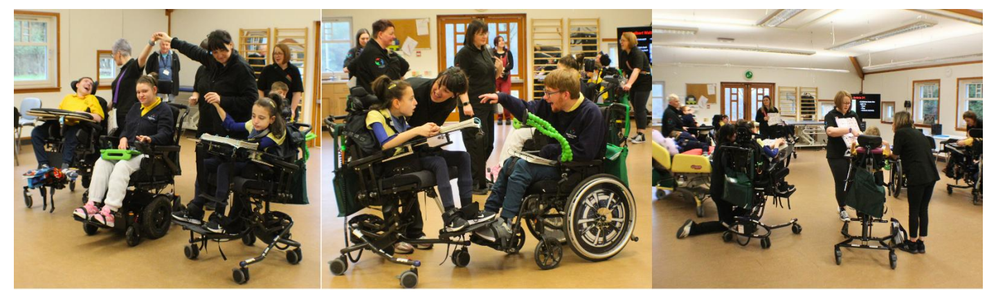
Ceilidh dancing and counting in Gaelic.

Several of our pupils have been making remarkable progress in using assistive technology to support their independence and choice-making. Notably, we have seen significant advancements in the use of switch devices, allowing children to access 'Alexa' and choose their own music. This achievement represents an important step in fostering autonomy and enhancing communication opportunities for our young people.