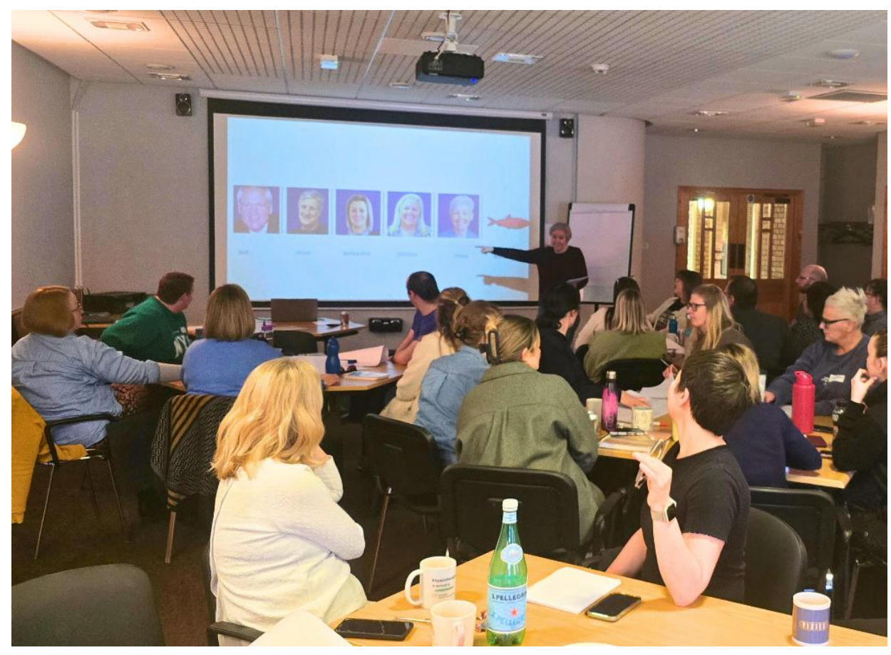
All staff In-Service day.