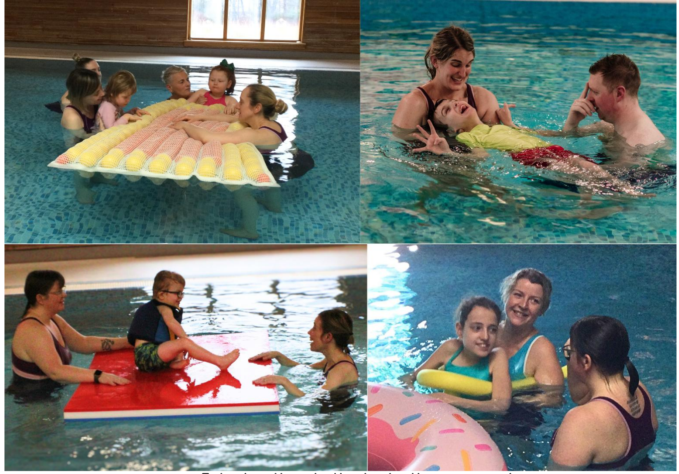
Enjoying time in the hydrotherapy pool.

Rockhopper Swim Awards, celebrating their progress in water confidence and mobility.