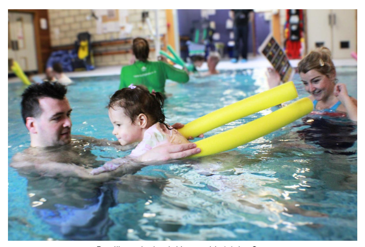
Families enjoying taking part in Water Space.

Our Water Space programme, delivered in partnership with Turtle Tots is established and we have received positive feedback from parents. Water Space is delivered by one of our physiotherapists and LCTP, working very closely with a Turtle Tot swimming instructor, using the properties of the hydrotherapy pool to further develop positive parent-child interactions, communication, posture and movement skills and confidence.